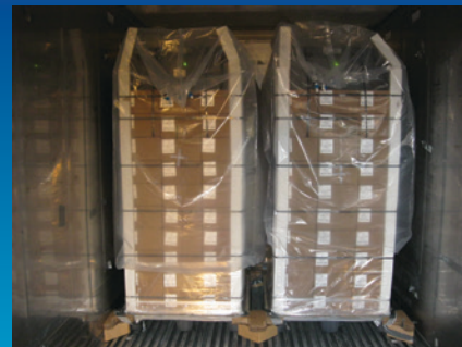
BluWrap's patented technology in action.

time-temperature indicators (TTIs) and temperatures cannot exceed 38°F. "The potential for botulism keeps the volume of MAP, unpasteurized, refrigerated fish far lower than frozen. Industry shies away from TTIs, but for now, TTIs are the principal hurdle to enable the fresh market," says Barbara Blakistone, vice president of aquatic food products, IEH Laboratories and Consulting Group. Alternatively, an aerobic environment within a package must be guaranteed via the use of high (10,000 cc/m 2 per 24 hr) oxygen transmission rate barriers.